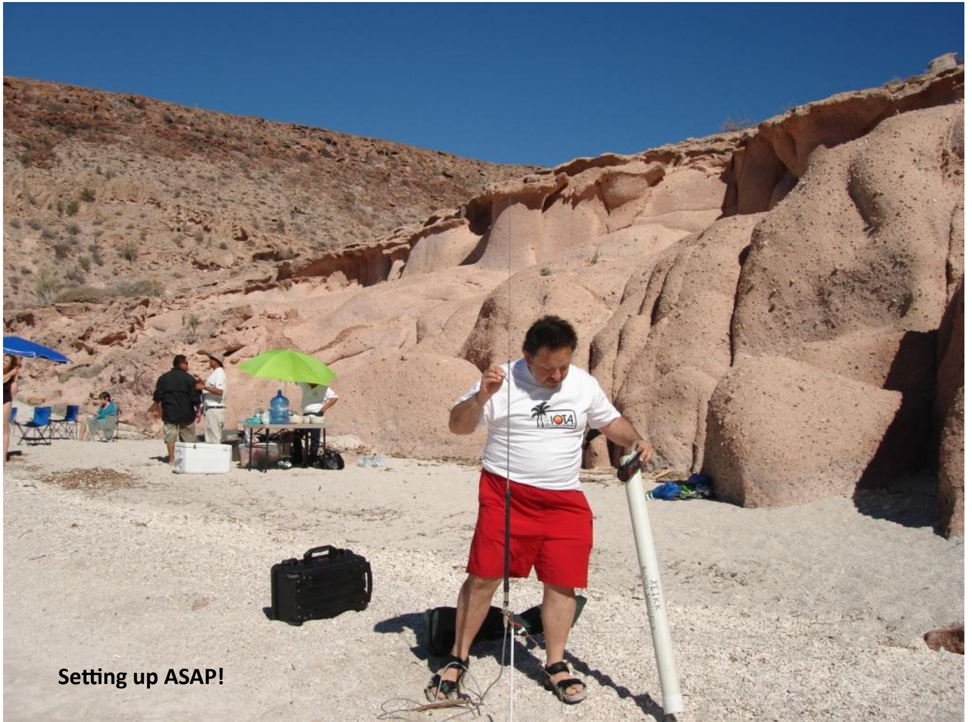
Setting up ASAP!